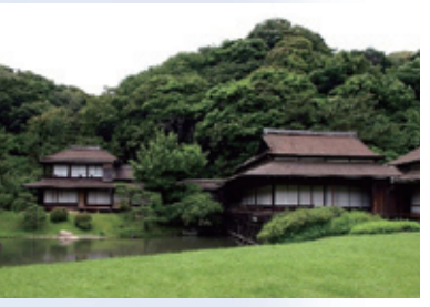
Sankei-en Japanese Garden