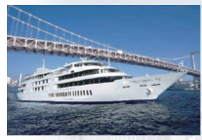
Tokyo Bay Cruise

This is a 1-day sightseeing tour which includes a Tokyo Bay Cruise, a visit to Odaiba and more.